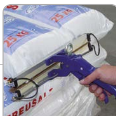
Resealing of opened provision bags