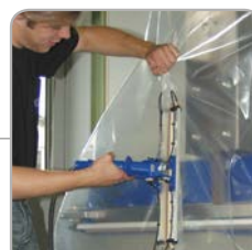
Mobile packaging of large, bulky goods